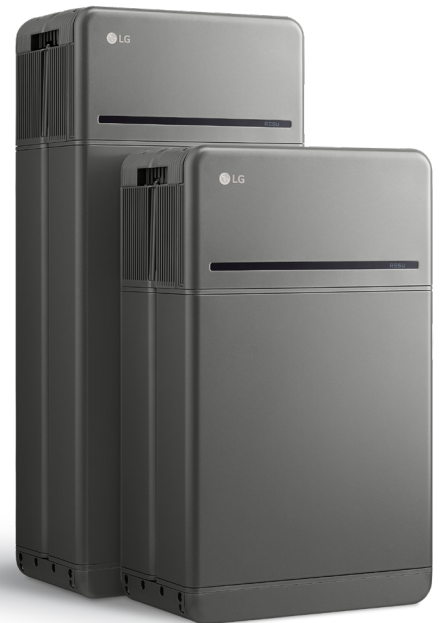
LG HBP battery (BLGRESU10HP) (BLGRESU16HP)