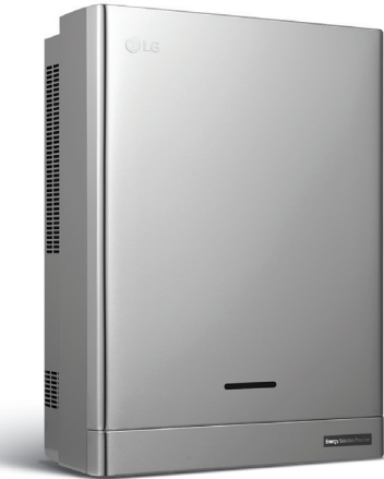
PCS (D008KE1N211) (D010KE1N211)