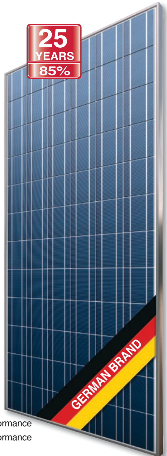
Fig. similar 72P156EN160502-111/1