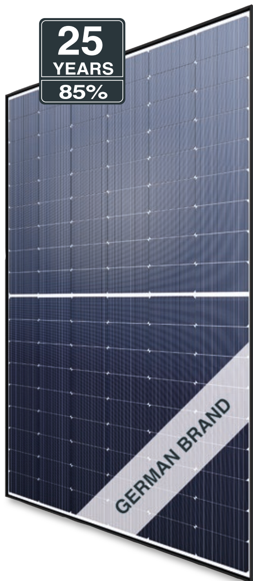
Fig. similar 108MHEN210225A

Exclusive linear AXITEC high performance guarantee!