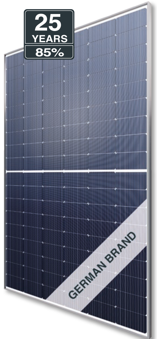
Fig. similar 108MHEN210225A

Exclusive linear AXITEC high performance guarantee!