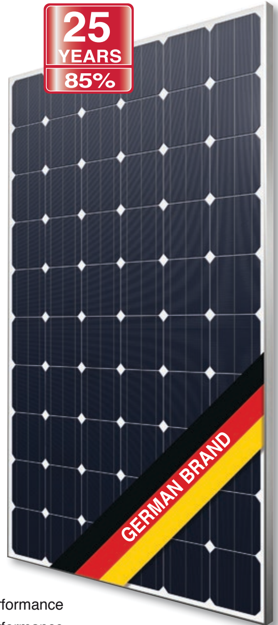
Fig. similar 60M156EN170131A-77/2

Exclusive linear AXITEC high performance guarantee!