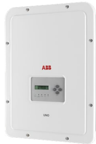
ABB string inverters UNO-DM-1.2/2.0/3.0-TL-PLUS 1.2 to 3.0 kW