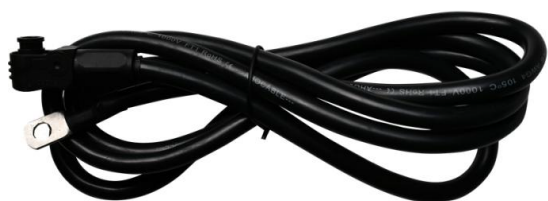
Negative battery power cable