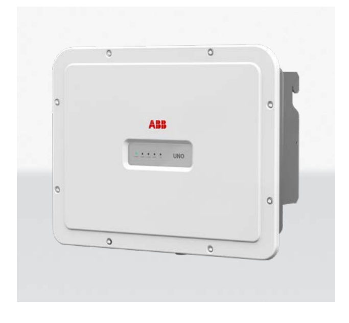
ABB string inverters UNO-DM-6.0-TL-PLUS-Q 6 kW