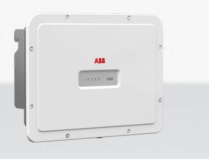
ABB string inverters UNO-DM-6.0-TL-PLUS-Q 6 kW