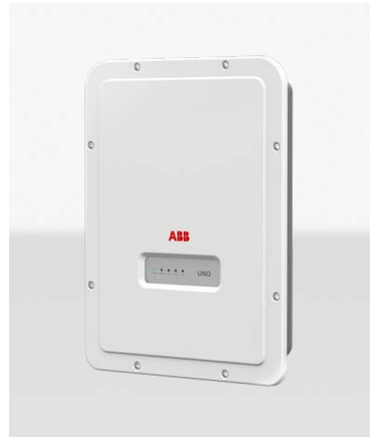
ABB string inverters UNO-DM-1.2/2.0/3.0-TL-PLUS-Q 1.2 to 3.0 kW